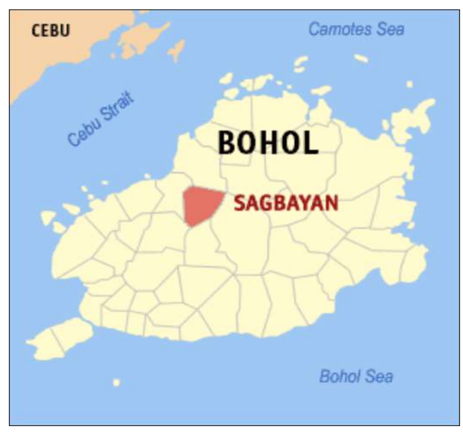
Figure 1. Location of Sagbayan, Bohol

farmers are employing such and what could have been the important factors that caused farmers to employ adaptation strategies. This paper reports the significant factors that may cause farmers to become climate change adaptive.