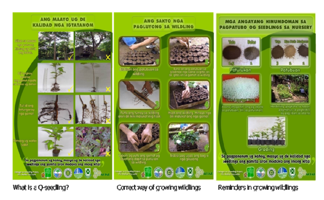
Figure 3. Cover pages of the instructional posters on seedling production technologies