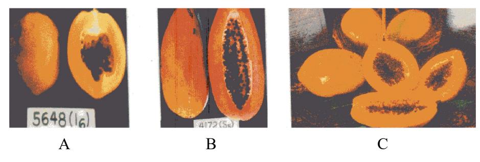
Figure 1. Inbred Lines 5648 (A) and 4172 (B) and their hybrid progeny, Sinta (C)