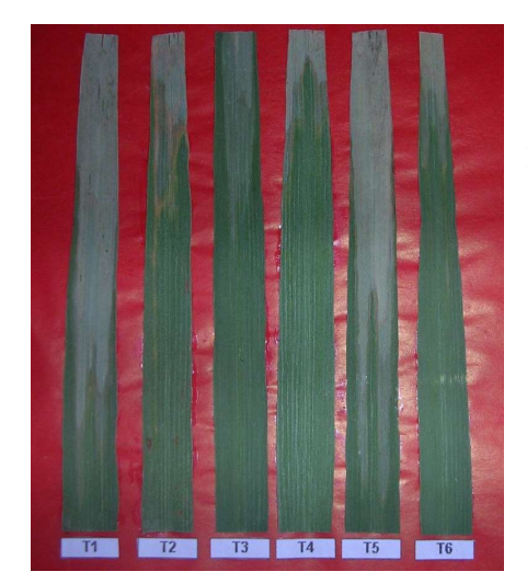
Figure 5. Bacterial blight lesions on IR24 as affected by varying concentrations of chitosan at 7 days after inoculation.