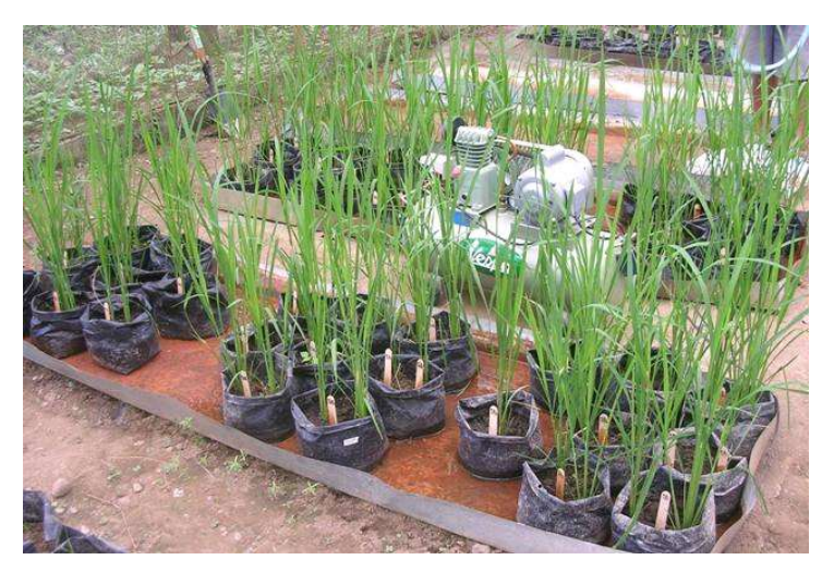
Figure 1. Experimental set-up in the screenhouse