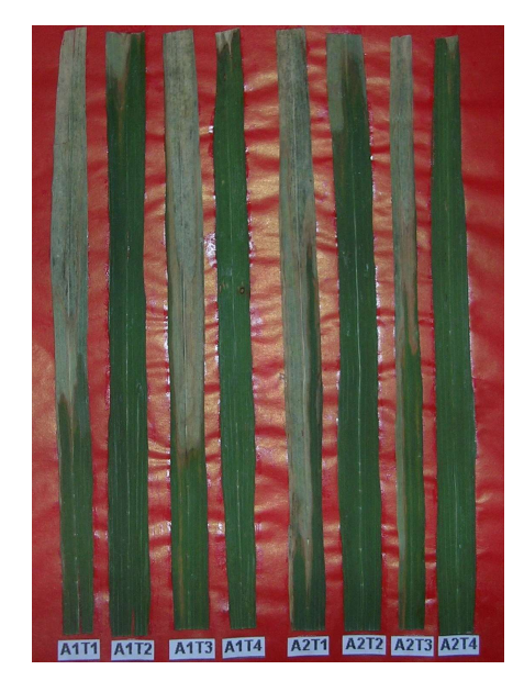
Figure 4. Bacterial blight lesions on IR24 as affected by different chemical treatments and varying intervals of application at 7 days after inoculation.

Legend: A1 - 5 days interval A2 - 10 days interval