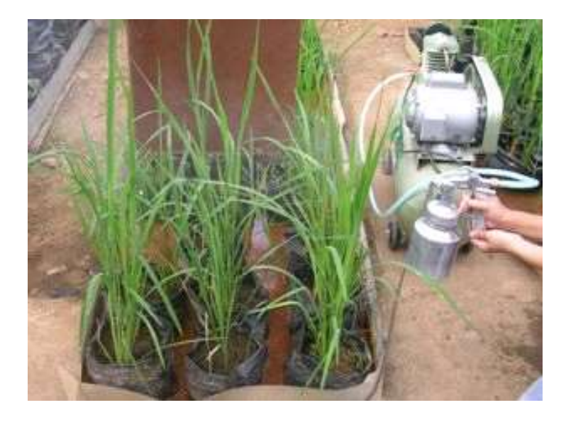
Figure 2. Spray application of chemicals on rice plants.