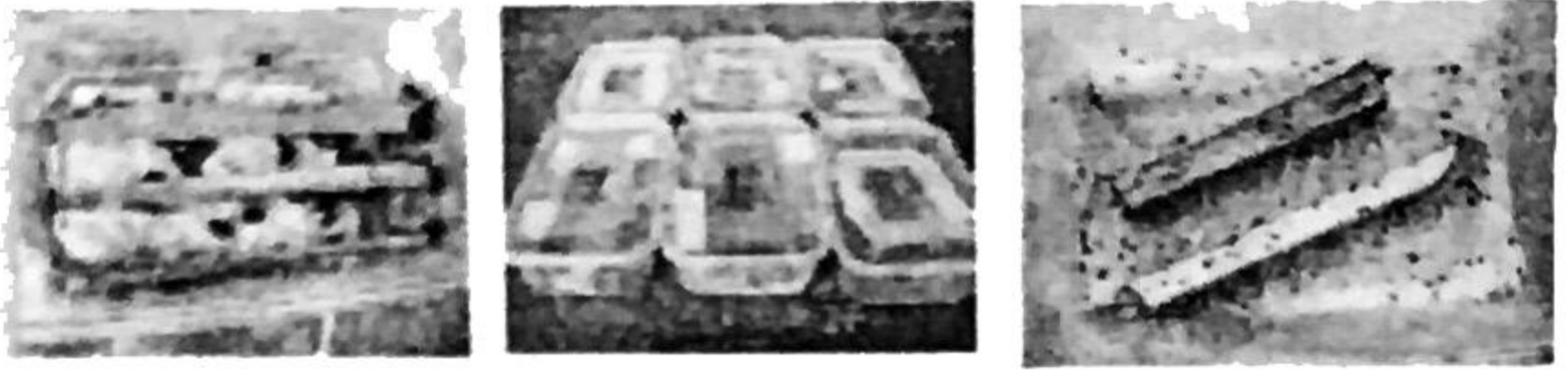
Figure 1. a) Field-collected RBB nymphs mass-reared on gabi stalks, b) plastic containers containing the mass reared insects, and c) 3rd instar RBB nymphs that are about to be introduced to rice plants.