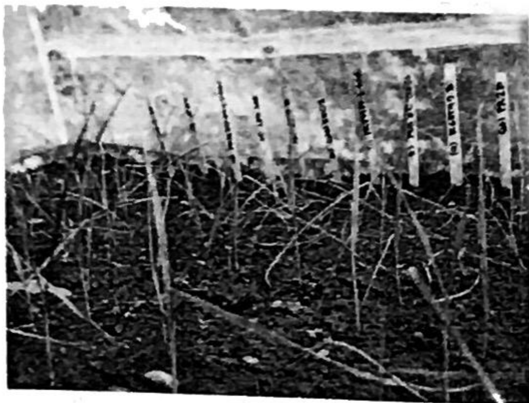
Figure 3. Test lines showing severe RBB damage. Some plants are already dead