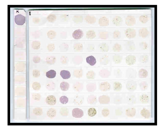
Fig. 2. Developed-NCM spotted with virus extract showing positive reaction to SPFMV. (A) Control lane showing positive reaction to SPFMV as purple spots (B) Reaction of different samples to SPFMV