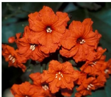
Figure 1: Cordia sebestena flower.