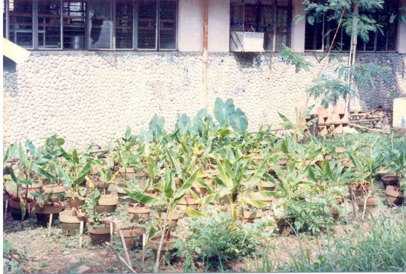
Figure 1. Pot screening of eight recommended abaca varieties against Fusarium oxysporum f.sp. cubense