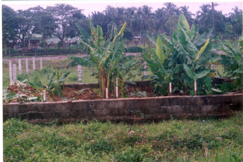
Figure 2. Field plot screening of abaca lines/varieties from the NARC Germplasm against Fusarium oxysporum f.sp. cubense .